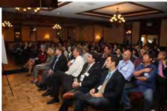
M/WBE Outreach Program Participants