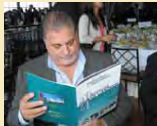
Perusing the Luncheon Brochure