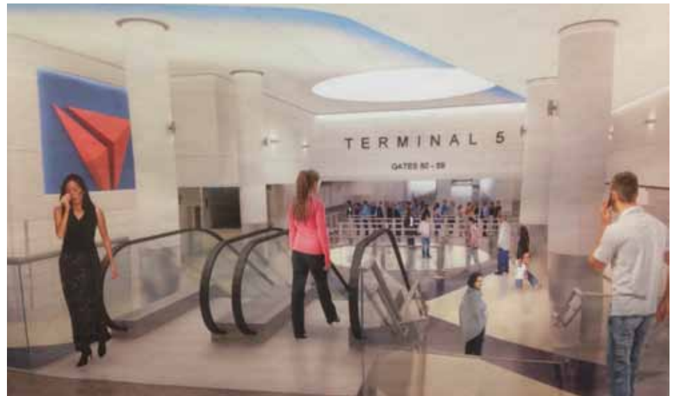
Delta Air Line Los Angeles International Airport Terminal 5 Rendering

Delta Air Lines expands the role of the Regional Alliance for Small Contractors (RASC) to help provide contract opportunities for small, minority and women-owned businesses at their Terminal 5 Renovation Program at Los Angeles International Airport (LAX). Delta Air Lines and Los Angeles World Airports (LAWA), the oversight agency for LAX, are investing $229 million to renovate Terminal 5. "RASC's success in implementing Delta's total commitment has helped M/WBEs to receive contract awards of over $100 million at Delta's facilities in New York and has led to extending our operation to the West Coast," states RASC Executive Director, Earle J. Walker.