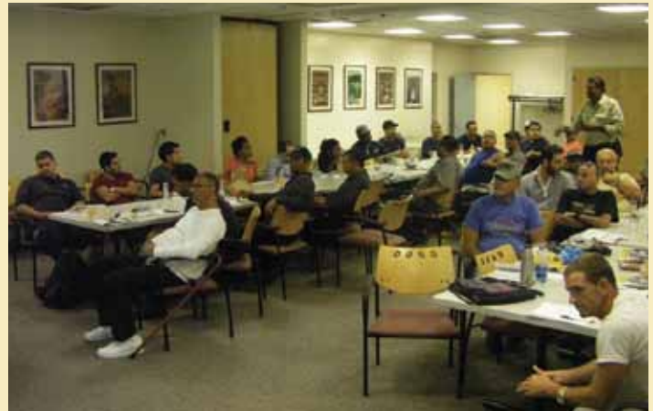
OSHA 10 HOUR Training Program

Managing Growth® is our award-winning classroom program that provides courses which enables both novice and experienced S/M/W/DBE owners and employees to learn the ins and outs of how to successfully operate their businesses. Courses are structured to focus on practical approaches to problems frequently encountered in construction and associated industries. The three core areas are business management, computer business applications, and OSHA Safety Training Certificate courses. Most courses are underwritten by our public sector clients, The Port Authority of New York and New Jersey and NJ TRANSIT.