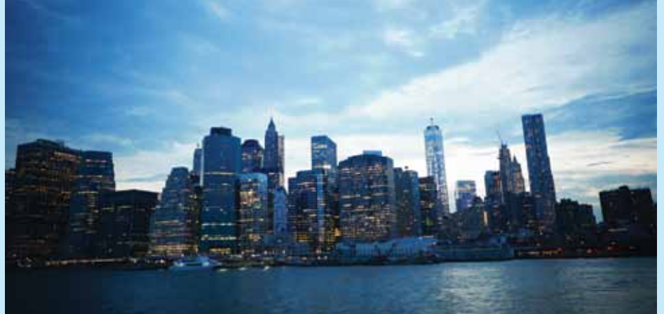
Picture perfect, evening cityscape