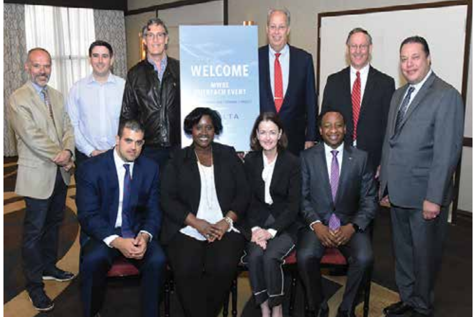
Senior project team STV/S&P JV (Delta's agency construction manager)

On June 6th of 2018 Delta Air Lines held its second M/WBE Outreach Event, almost a year to the date of the first event held on June 13, 2017. The Sheraton LaGuardia East Hotel venue was filled to capacity with eager M/WBE firms seeking to gain access to the Delta Air Lines LaGuardia Airport New Terminal C Program. Why not, as