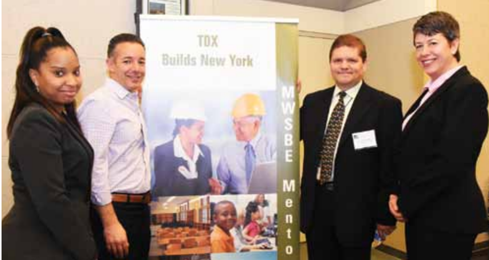
TDX Construction Corporation