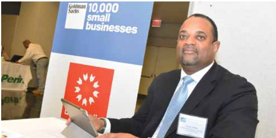
Goldman Sachs 10,000 Small Businesses