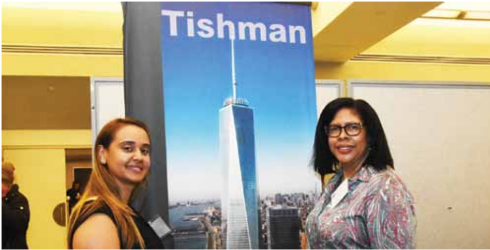
Tishman Construction Corp.