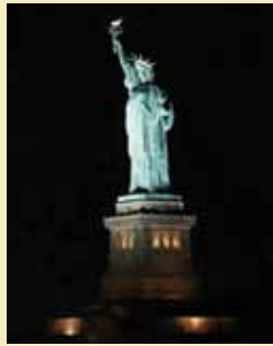
Lady Liberty standing tall