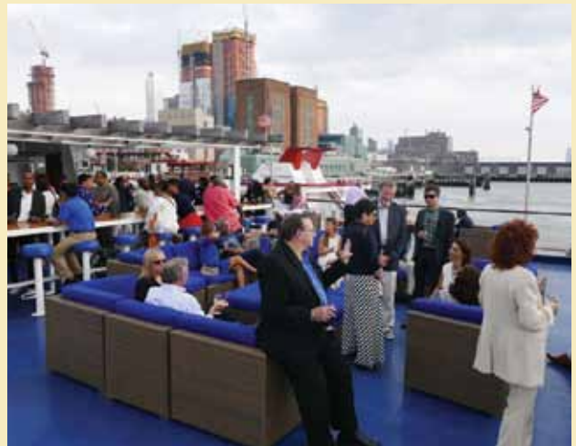
Networking on the Hudson

owned business enterprises (MWBES) resulting in $1.6 billion in regional economic development and nearly $450 million in new job opportunities that were associated with these contract awards," she stated.