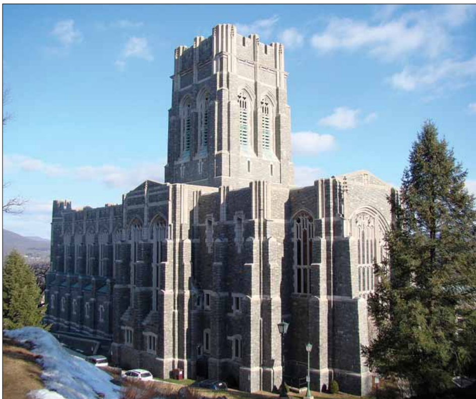
Cadet Chapel, West Point Academy

Challenging historical restorations have been a proven niche for ICC. Some West Point Academy projects include Washington Hall where part of the scope required the replacement of 19th-century windows and hardware. “We found the five-generation old business that had manufactured the original