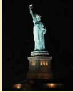
Lady Liberty standing tall