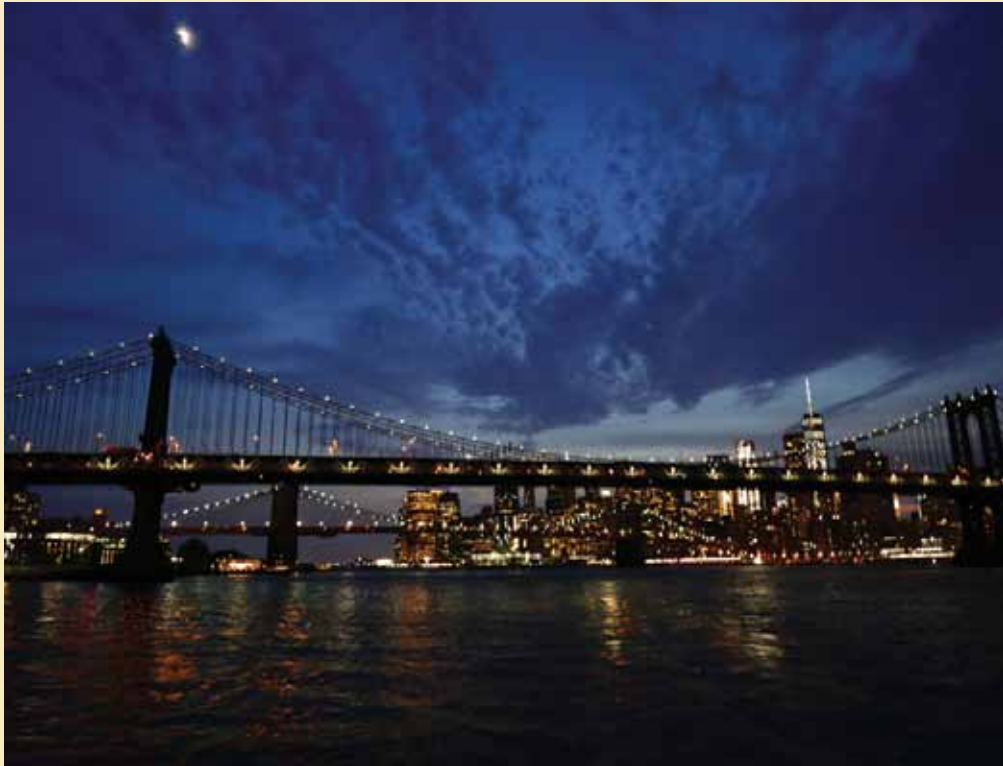
A picture perfect sky over Manhattan Bridge