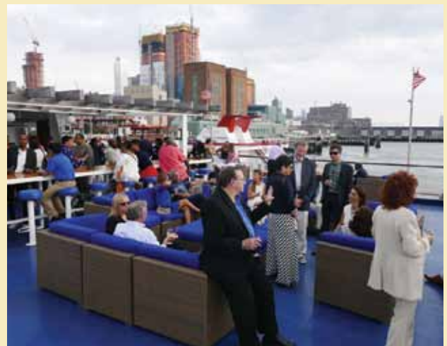
Networking on the Hudson

owned business enterprises (MWBES) resulting in $1.6 billion in regional economic development and nearly $450 million in new job opportunities that were associated with these contract awards," she stated.