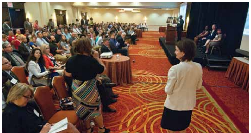
A full house enjoying the Kick-off Outreach Event