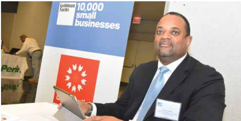
Goldman Sachs 10,000 Small Businesses