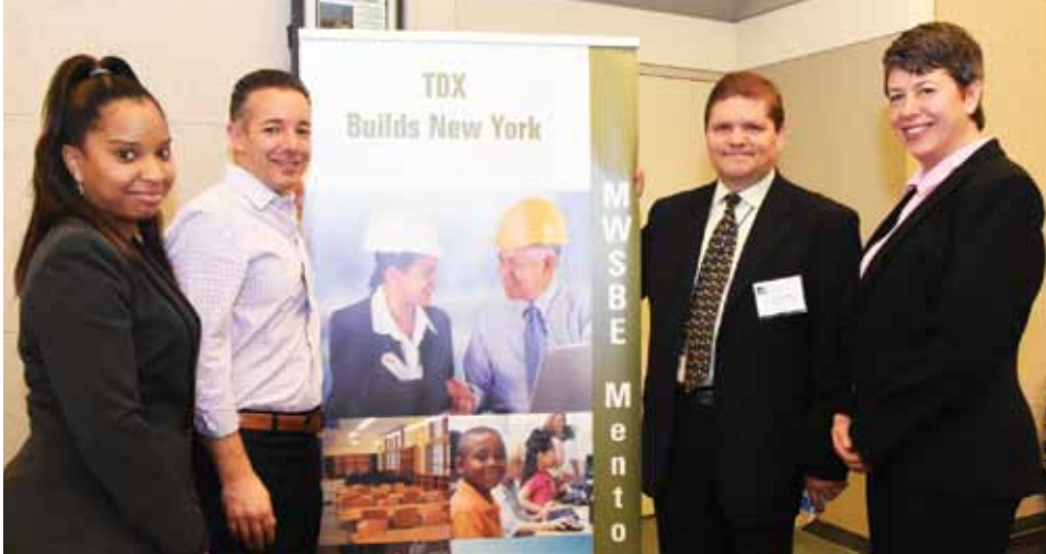
TDX Construction Corporation